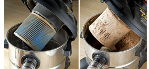
With Air Flux separator