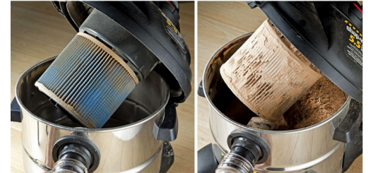
With Air Flux separator