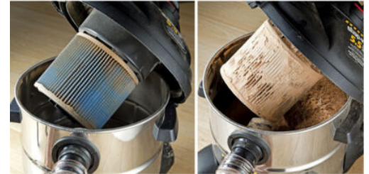
With Air Flux separator