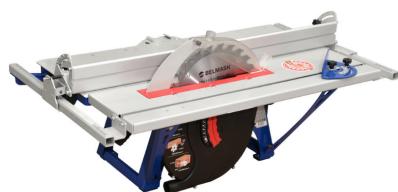
BELMASH - SDM2500 saw and planer