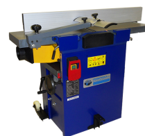
Planer thicknesser Triple Medium TT260