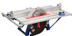
BELMASH - SDM2500 saw and planer