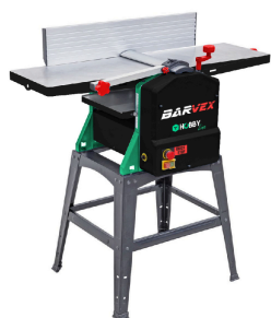
BARVEX Thicknesser Double 260