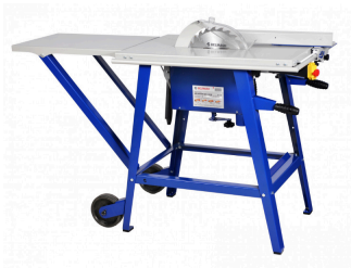
BELMASH - CBS2400 saw table