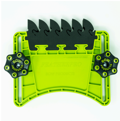
BOW FeatherPRO FP1 featherboard