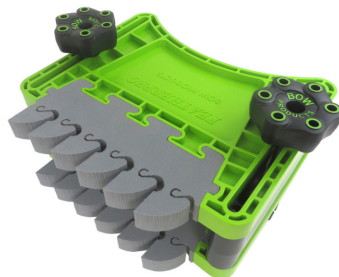
BOW FeatherDUO FP3 featherboard