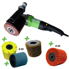
Durotec structure brush machine | Promoset METAL