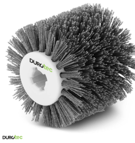
Durotec nylon brush Duro-Nyl