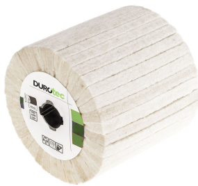
Durotec abrasive brush Duro-Flap