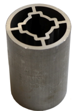
Durotec spacer ring Duro-Spacer