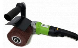
Durotec structure brushing machine WT100/800DE