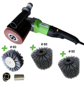
Durotec structure brush machine | Promoset WOOD