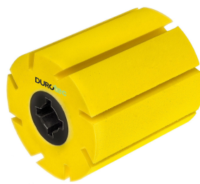
Durotec polishing brush Duro-Polish