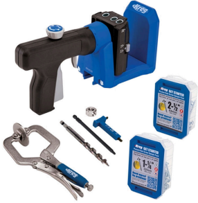
Kreg Pocket-Hole Jig 520 Pro