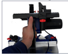
Links gebruik / Utilisez à gauche