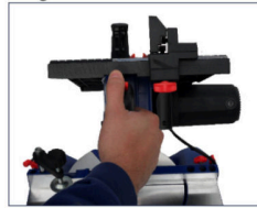
Rechts gebruik / Utilisez à droite

The TT305UTC is the big sister of the TT255UTC. The saw has a 305 mm saw blade with 60 teeth (compared to 255 mm and 48 teeth on the TT255UTC).