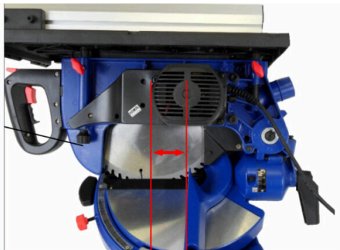
Grote capaciteit dankzij de riemaandrijving motor achteraan + groot koppel / Lame entraînée par courroie le max d'attelage