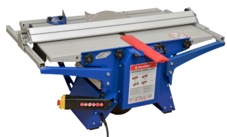
BELMASH - SDMR2500 saw and planer thicknesser