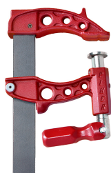
PIHER - Maxipress F