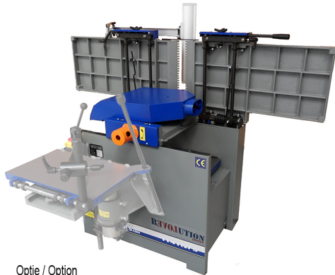
Optie / Option Boortafel / Drilling table / Table à mortaiser