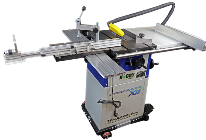
TABLE SAW COMPACTO TT1000 X8