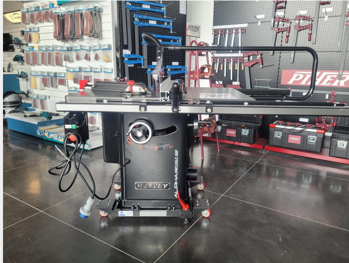
TABLE SAW HARVEY ALPHA HW110LC-36P - 36" (910 MM) - 2 HP