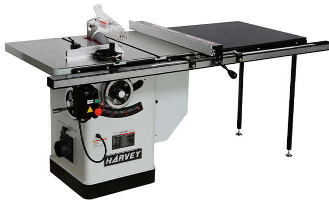
TABLE SAW HARVEY HW110SE-50 - 50" (1270MM)