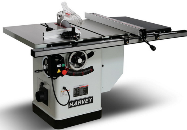
TABLE SAW HARVEY HW110SE-30 - 30" (760MM)