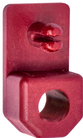
TABLE SUPPORT FOR PRL400