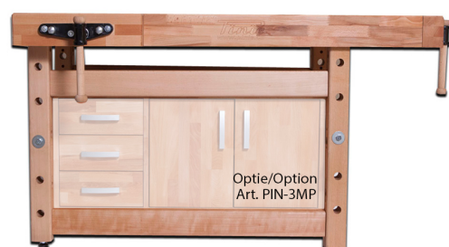
Optie/Option Art. PIN-3MP