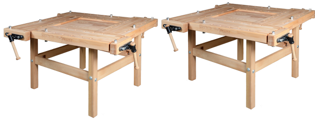
Wooden workbench School Series fixed height 850mm - four work positions